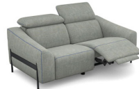
C2ER (170 cm x 80 cm x 110 cm) (80 kg / 2 pcs)