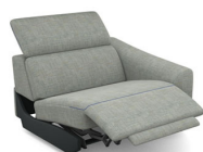
B150ER (105 cm x 80 cm x 110 cm) (44 kg / 1 pcs)