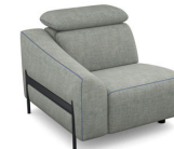
B100L (86 cm x 80 cm x 110 cm) (33 kg / 1 pcs)