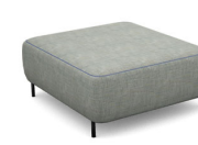
P000 (100 cm x 45 cm x 110 cm) (38 kg / 1 pcs)