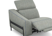
B100EL (86 cm x 80 cm x 110 cm) (38 kg / 1 pcs)