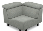
EK03 (110 cm x 80 cm x 110 cm) (42 kg / 1 pcs)