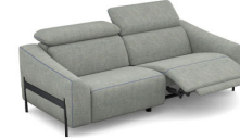
C3ER (210 cm x 80 cm x 110 cm) (110 kg / 2 pcs)