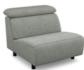
E150 (85 cm x 80 cm x 110 cm) (32 kg / 1 pcs)