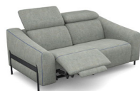
C2EL (170 cm x 80 cm x 110 cm) (80 kg / 2 pcs)