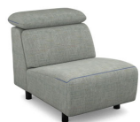
E100 (66 cm x 80 cm x 110 cm) (25 kg / 1 pcs)

Modules disponibles (Available modules):