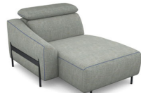
CH00L (105 cm x 80 cm x 160 cm) (61 kg / 1 pcs)