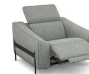
F1EL (106 cm x 80 cm x 110 cm) (40 kg / 1 pcs)