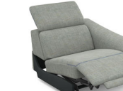
B100ER (86 cm x 80 cm x 110 cm) (38 kg / 1 pcs)