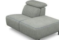
IS00R (134 cm x 80 cm x 110 cm) (51 kg / 1 pcs)