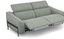
C3E2 (210 cm x 80 cm x 110 cm) (121 kg / 2 pcs)