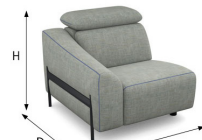
Dimensions (W x H x D cm) (kg net / pcs)