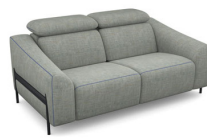
C200 (170 cm x 80 cm x 110 cm) (65 kg / 1 pcs)