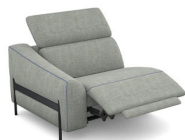
B150EL (105 cm x 80 cm x 110 cm) (44 kg / 1 pcs)