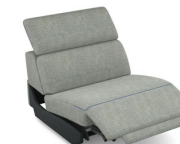
E150EL (85 cm x 80 cm x 110 cm) (32 kg / 1 pcs)