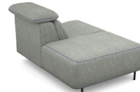
IS00L (134 cm x 80 cm x 110 cm) (51 kg / 1 pcs)