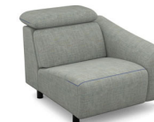
B100R (86 cm x 80 cm x 110 cm) (33 kg / 1 pcs)