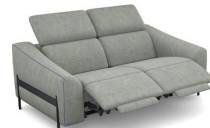
C2E2 (170 cm x 80 cm x 110 cm) (92 kg / 2 pcs)