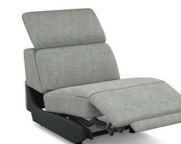
E100EL (66 cm x 80 cm x 110 cm) (25 kg / 1 pcs)