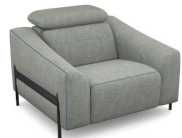
C100 (106 cm x 80 cm x 110 cm) (40 kg / 1 pcs)