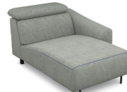
CH00R (105 cm x 80 cm x 160 cm) (61 kg / 1 pcs)